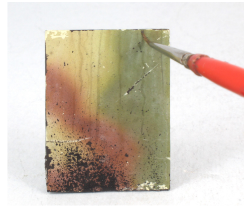
Playing with all the possibilities of the product, as well as thinning it down, you can depict various other effects, like streaking grime or dirty water.