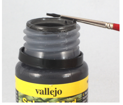
Like the rest of references of the Splash Mud range, this is a water based product, no smell, no odor, and you can clean the used tools easily. This is the natural look just out of the bottle.